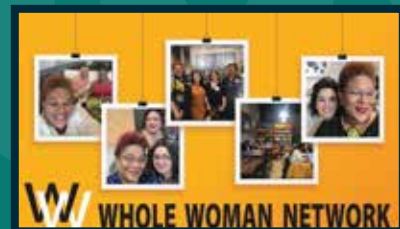
The Whole Woman Network

This Award recognizes a Peer Lending Circle's efforts to "Give Back" to each other, to PARO and to their community.